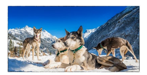
Figure 4. My weekend with the dogs! (Κλενγελ, 2013)