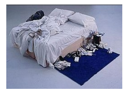
Figure 1. My Bed by Tracey Emin (Brown, 2006, p. 34)

If including the image in your work, use the following layout and reference the book and page number underneath as you would a direct quote.