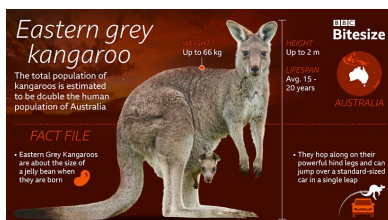
Figure 2: Eastern Grey Kangaroo (BBC, 2019)