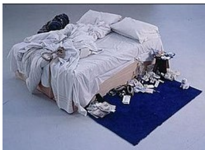
Figure 1: My Bed (Emin, 2006)